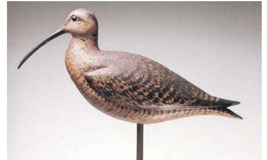
This decoy, carved by William Bowman of Long Island, New York, c. 1890, sold for $10,500 in 1973. It was the first decoy to sell for more than $10,000, but it turned out to be a good investment. In 2000, the decoy was re-sold at a joint auction by Guyette & Schmidt, Inc. and Sotheby's for $464,500.