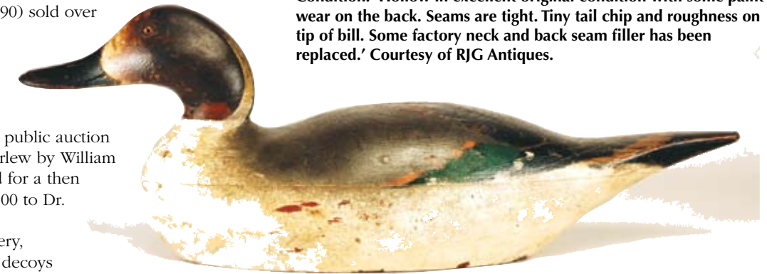
BELOW: This Mason Premier pintail drake decoy, c. 1910. Condition: 'Hollow in excellent original condition with some paint wear on the back. Seams are tight. Tiny tail chip and roughness on tip of bill. Some factory neck and back seam filler has been replaced.'

||||| "for the first time, decoys were broadly recognized as a legitimate form of American folk art" |||||